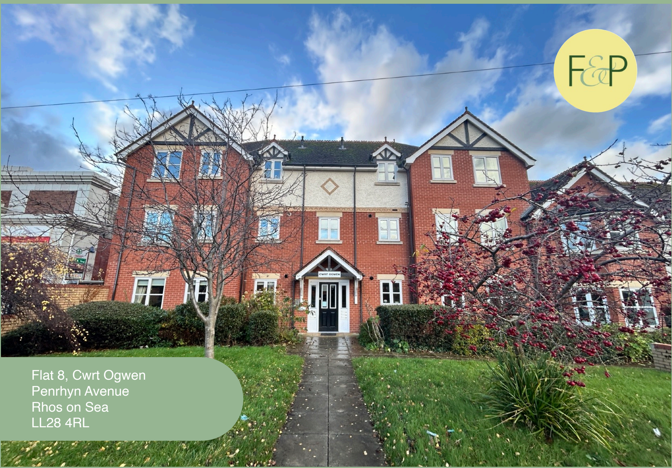
Flat 8, Cwrt Ogwen Penrhyn Avenue Rhos on Sea LL28 4RL